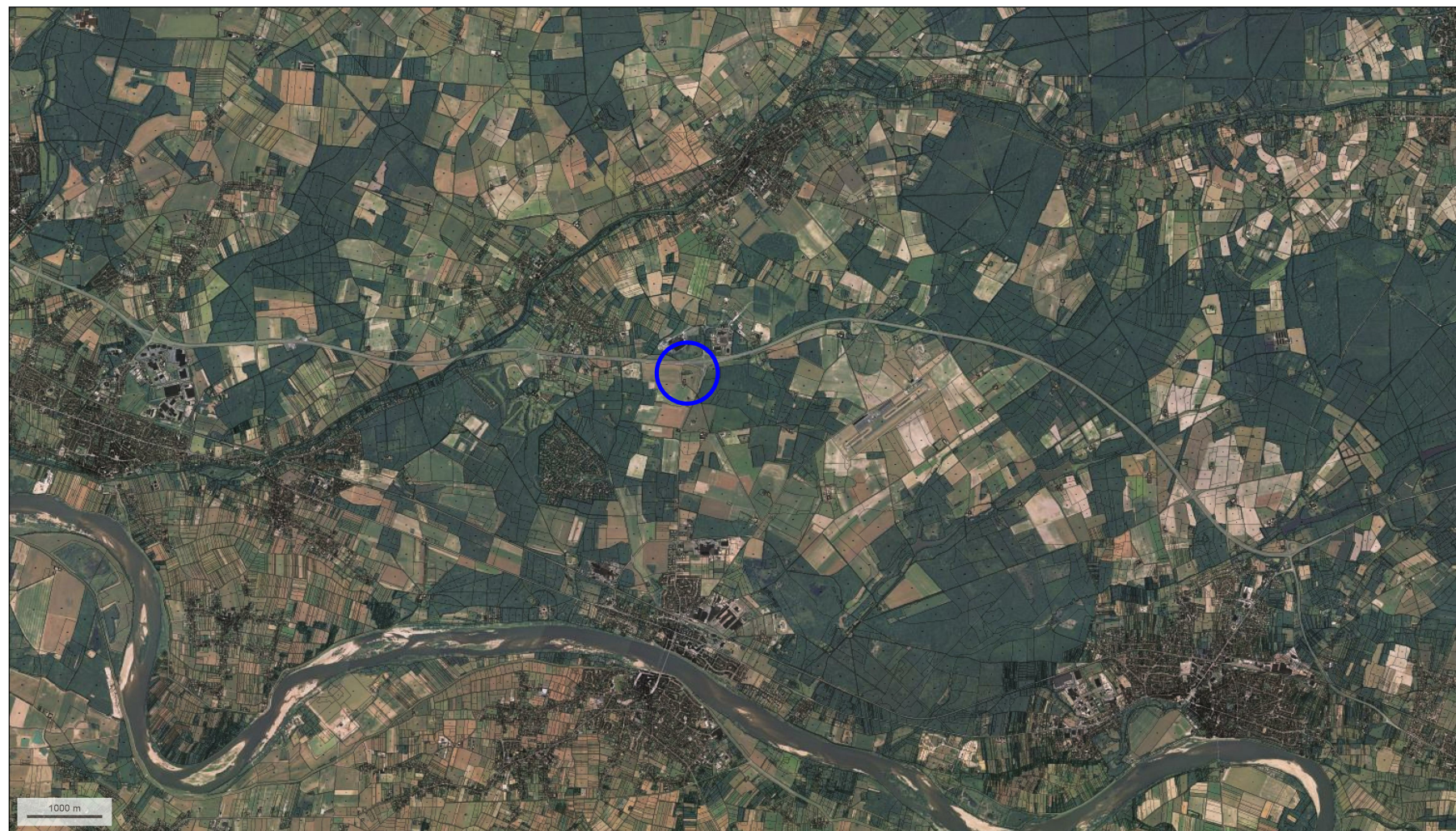
plan de situation ech 1/60000