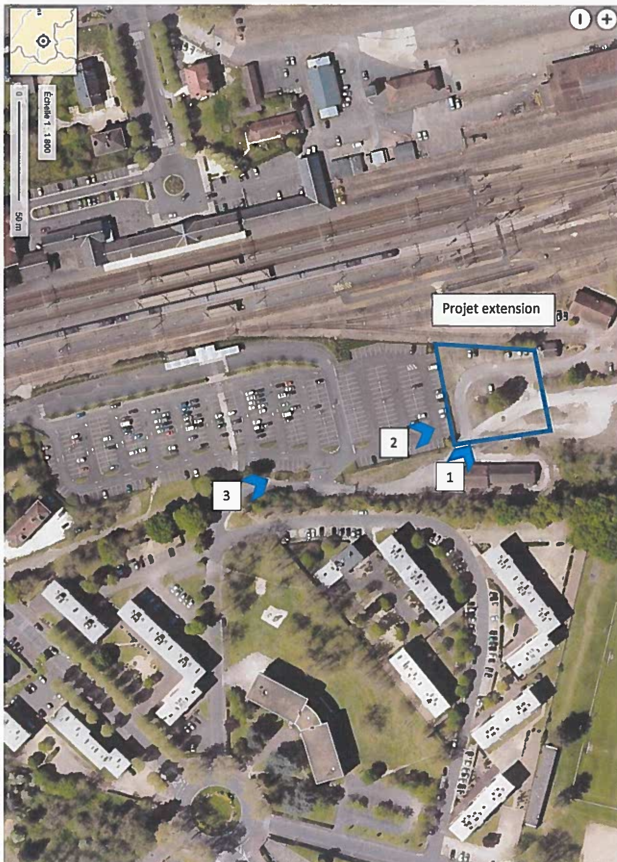
SITUATION DES PHOTOS